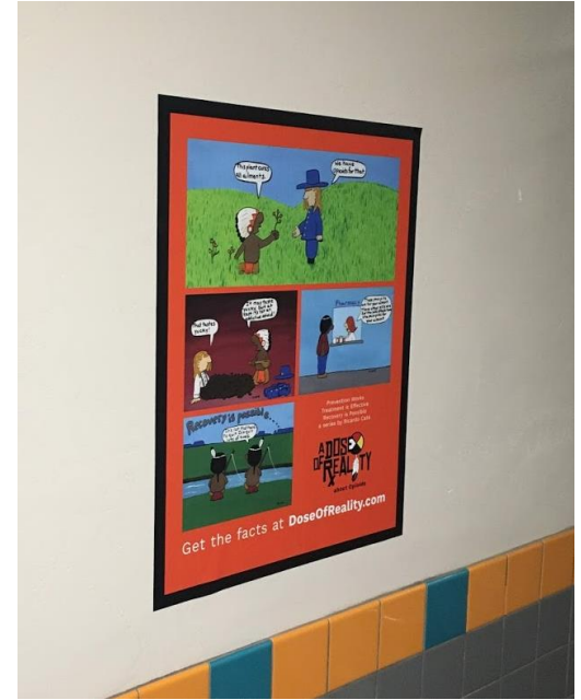
DIFFERENTIAL BREWING 500 YALE BLVD SE