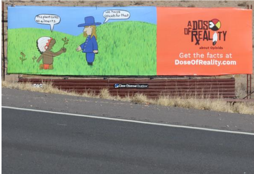
SOUTH OF ABQ