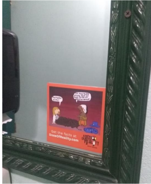
SHAMROCK 2099 HWY 70 E