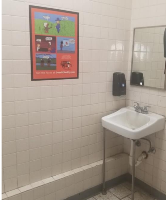
LOS LUNAS CHEVRON 1655 MAIN ST SW