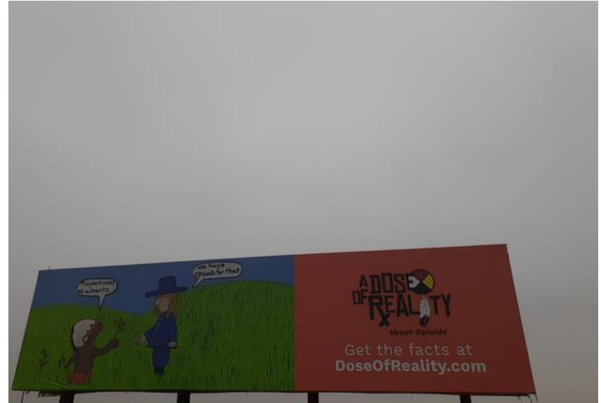
WEST OF ABQ TOWARDS LAGUNA