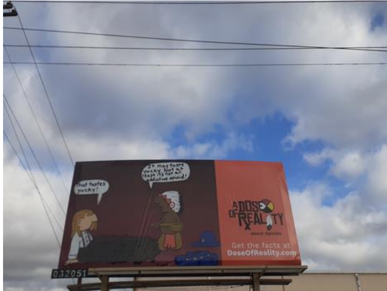
NEAR INDIAN PUEBLO CULTURAL CENTER